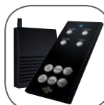
RF Remote & Receiver Kit DLA4RKT