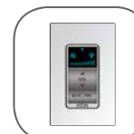
In-Wall Touchpad DLATP*

The front panel of the DLA unit can also be used to control the audio. *Available first quarter, 2008.