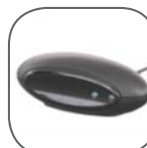
Tabletop IR Receiver AIR5