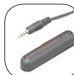
Surface-Mount IR Receiver AIR1b